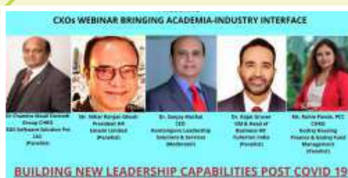
A CXOs Webinar on "New Leadership Capabilities Post Covid 19"