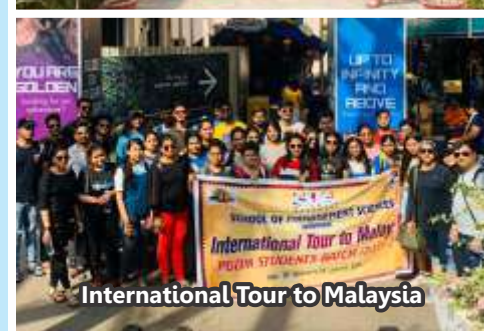
International Tour to Malaysia