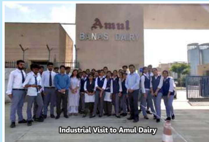
Industrial Visit to Amul Dairy