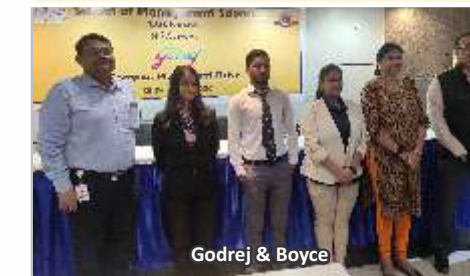
Godrej & Boyce