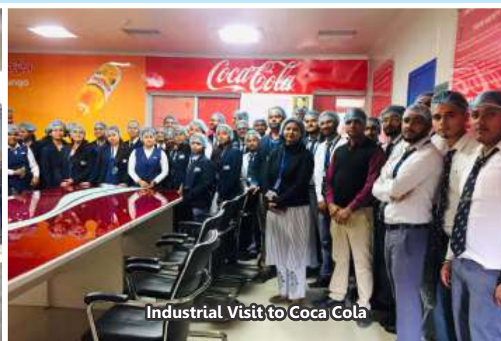
Industrial Visit to Coca Cola