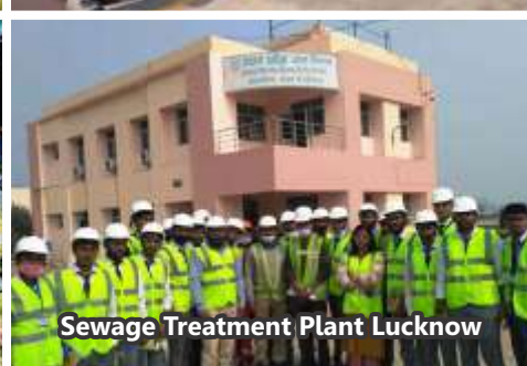
Sewage Treatment Plant Lucknow