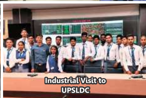
Industrial Visit to UPSLDC