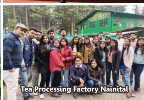
Tea Processing Factory Nainital