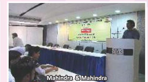
Mahindra & Mahindra