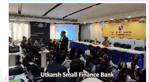
Utkarsh Small Finance Bank