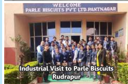
Industrial Visit to Parle Biscuits Rudrapur