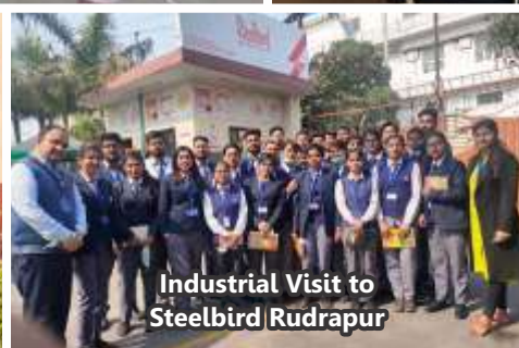
Industrial Visit to Steelbird Rudrapur