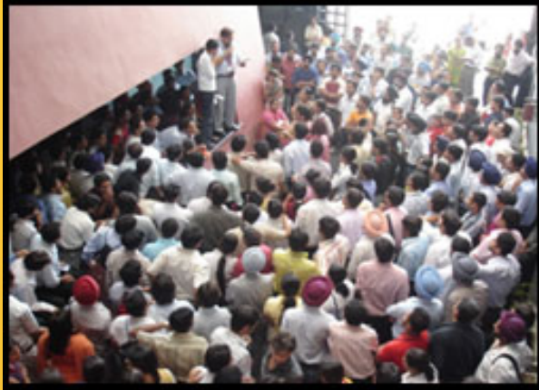
Results announcement (PA)