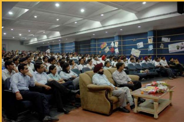
Auditorium with seating capacity of up to 1,000