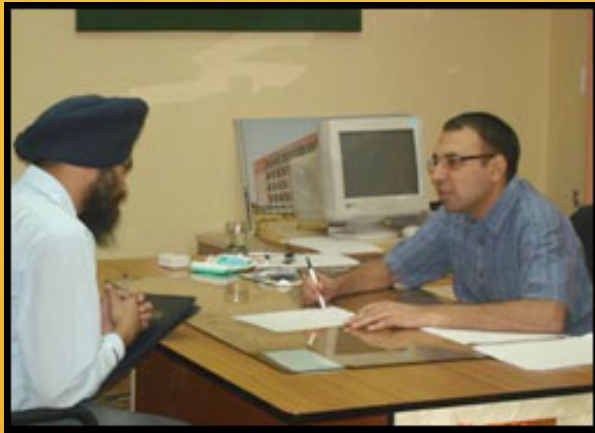
1 to 1 interaction