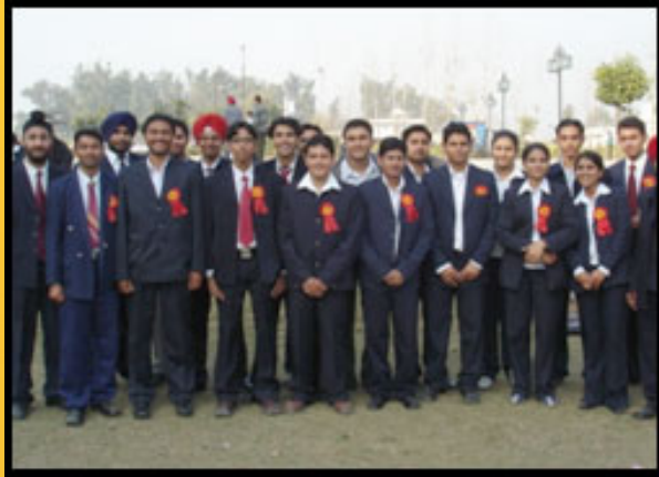
Student Placement cell Team

We facilitate the above to enhance the credibility of a company among students.