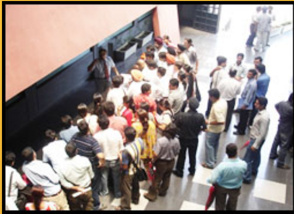
Special Announcement to Students