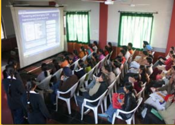
Live broadcasting for parallel PPT