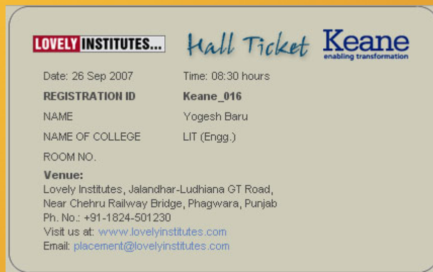
Snapshot of Hall Ticket