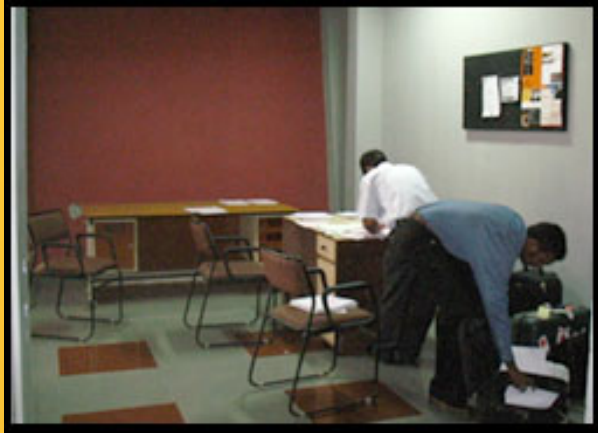
Company officials setting Equipment