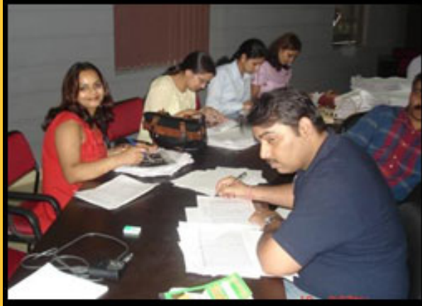
Test check by Faculty & Students

All activities are centralized from the Control Room. The test correction can be done in one of the following ways: