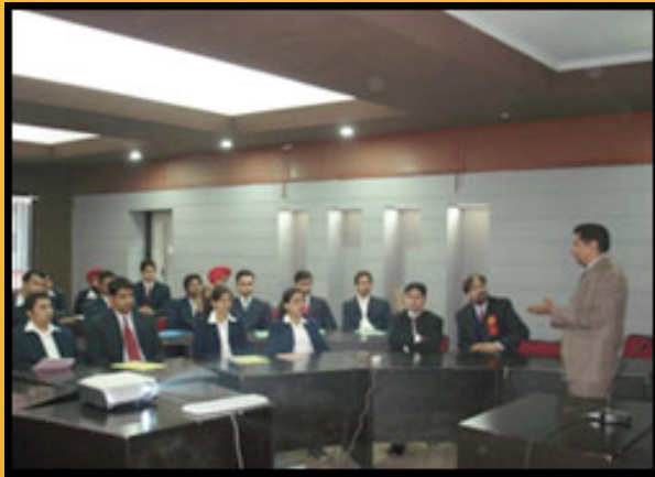
A brief to participating students