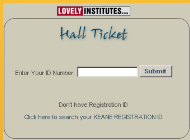
Web view to download hall ticket against registration number