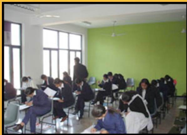
Test conduction in Auditorium