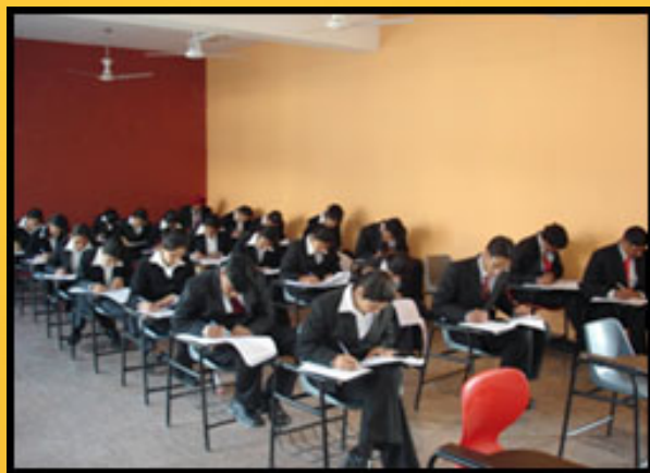
Written Test in Rooms