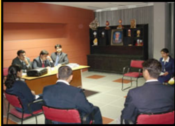
A snapshot of ongoing GD round