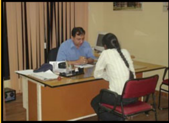
Interview in Process