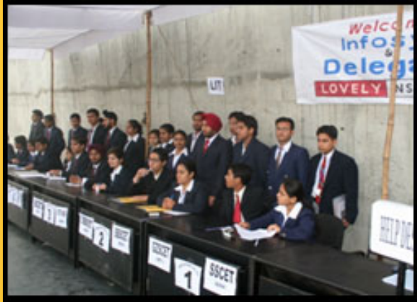
18 colleges divided among 9 groups