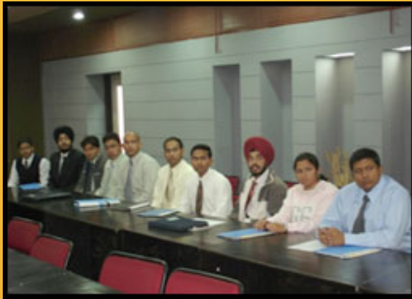
Instructing Faculty for Checking test