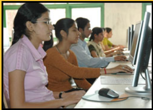
Students giving Online Test